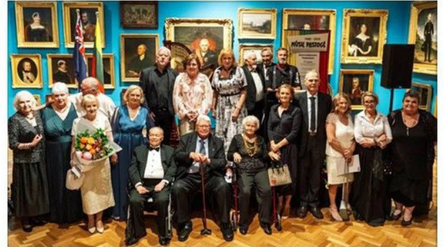
Šių metų lapkričio 29 dieną Lietuvos Respublikos Spaudos Sąjunga Vokietijos šalininkų Rikšdingoje Atstovėlikaime su "Mūsų Pastogė" kolektyvu, šventėje dalyvavę Spaudos Sąjungos nariai, "M.Š." žurnalistai, rašytojai, literatūriniai svečiai ir choro nariai. Apie tai – šiame "M.Š." puslapyje.