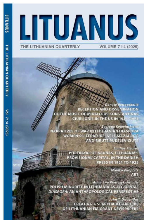
The cover of the latest Lituanus issue.