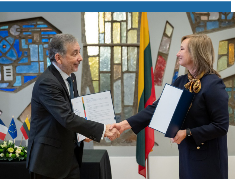
The national libraries of Lithuania and France agreed to develop cultural ties between the countries.

publications by Adam Mickiewicz, booksmugglers' press and interwar photographs. The manuscripts and correspondence of Oskaras Milašius (Oscar Vladislav de Lubicz Milosz), a poet, diplomat and the first representative of independent Lithuania in France, occupies a special place. He is one of the most prominent personalities connecting Lithuania with France. The majority of his work was written and published in France. In 2027, we will celebrate the 150th anniversary of Milašius's birth.