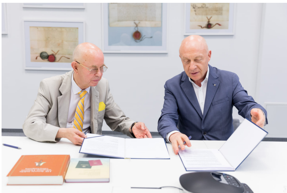
The signing of the documents.