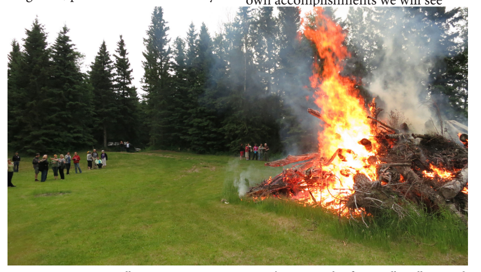
Alberta Estonian Heritage Society's Jaanipäev bonfire at Gilby, Alberta with members of Toronto's Ööbik Choir among the guests. June 2012.

Perhaps if we take a page from our own accomplishments we will see